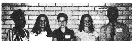
Academic scholarship recipients.

— a sure sign of more exciting times and successes at the Sumter Center. Students will be receiving at the Sumter Center the "more classes and services" that they requested.