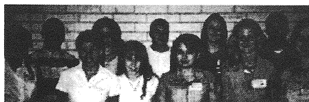
Academic scholarship recipients.