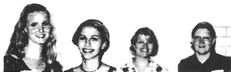
Academic scholarship recipients.